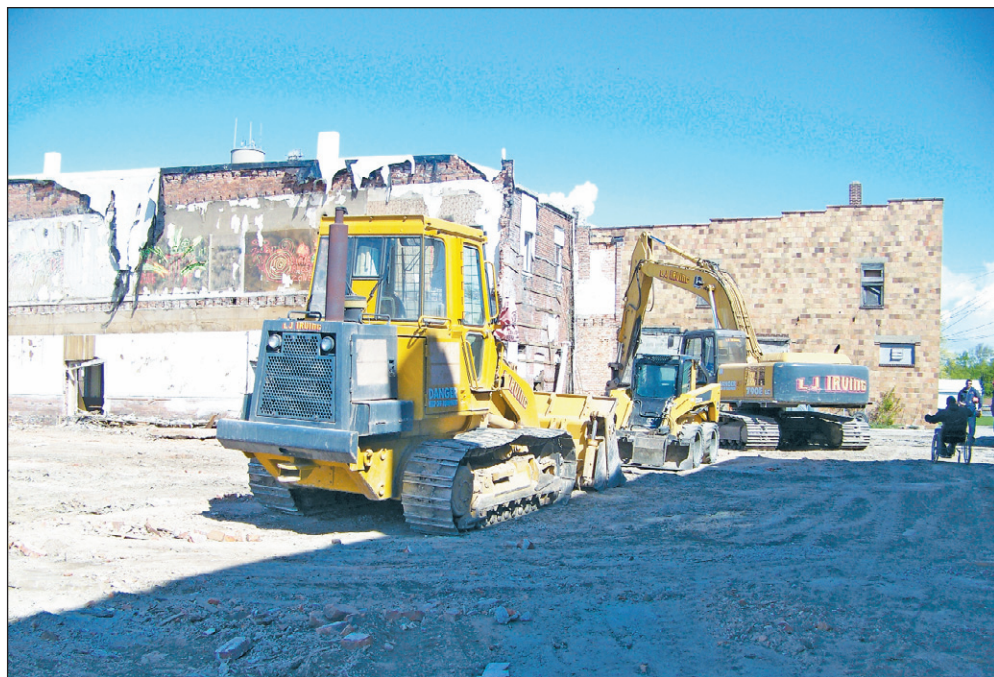
The final portion of demolition in downtown Payne was occurring earlier this week in order to make way for the construction of a new Antwerp Exchange Bank at the corner of Merrin and Main Streets. Town officials anticipate that final demolition and cleanup should be completed by the end of this week.